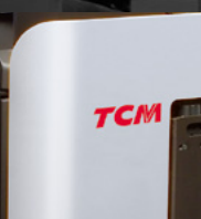
performance silver (only available in the UK)

TCM offers a broad range of options for maximum customisation. Please ask your dealer.