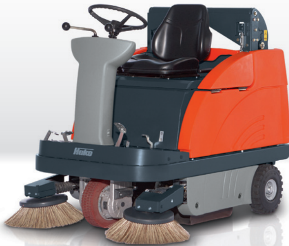
Sweepmaster B980 RH