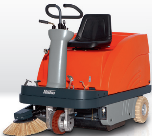
Sweepmaster B900 R