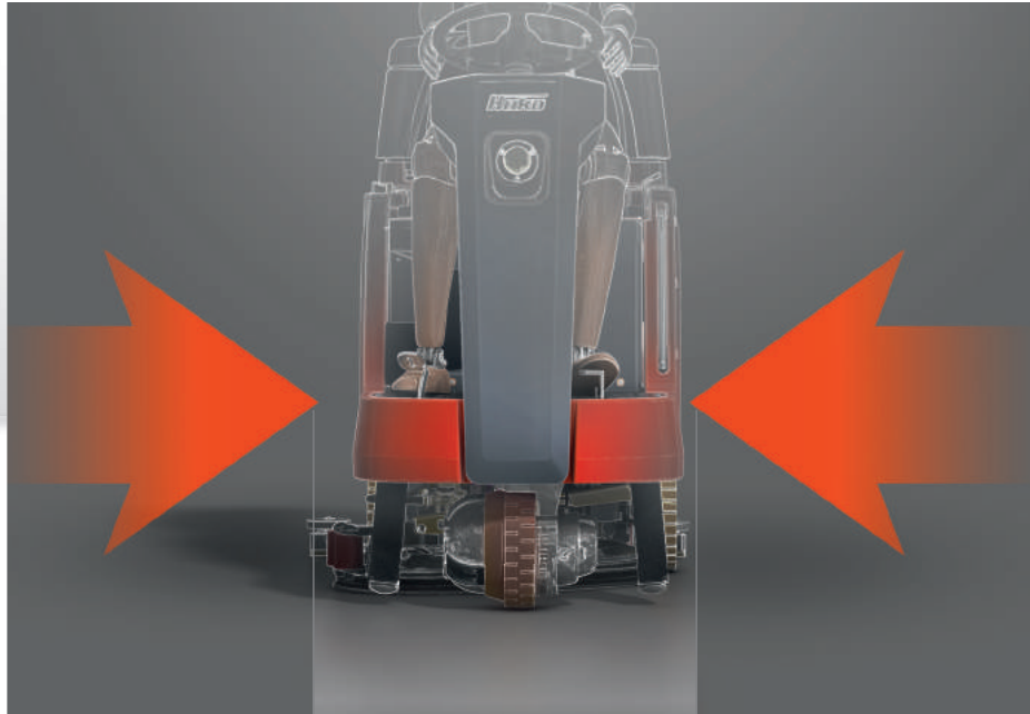
Clearance width 76 cm Ideal for checkout areas