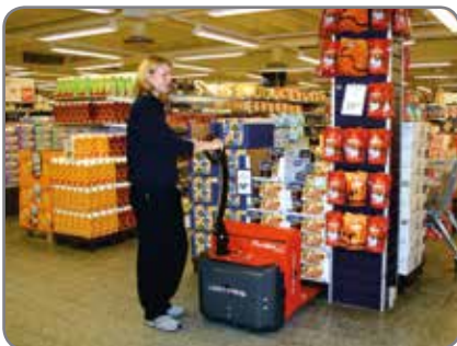
Panther Mini (capacity 1400 kg) is recommended for easy pallet transport, e.g. in super markets and in stock areas.