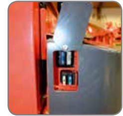
Easy access to all components makes service of the truck straightforward.