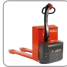
Strong construction ensures a long operating life and low maintenance costs.