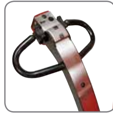
Possible to operate with handle upright. Central location of all control buttons.