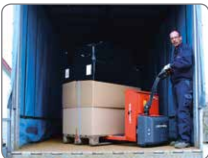
Panther Maxi (capacity 1800 kg) is recommended for heavy pallet transport, e.g. in the transport industry.